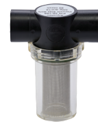
Timer and Filter included in KCPC